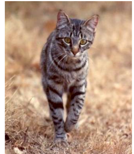
Feral cats have a home - outdoors!